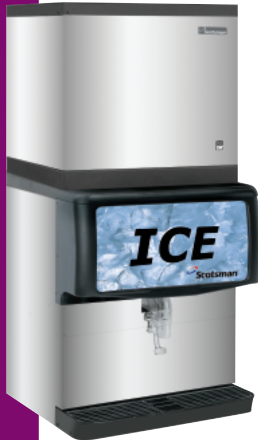
CME1056 on BD200

Scotsman ID & BD series dispensers provide durable, reliable performance under the most demanding conditions. Heavy-duty construction and components assures longer life. The insulated, heavy-duty drip tray prevents condensation that can leak on countertop causing damage and/or sanitary issues. Stainless steel exteriors provide an attractive and inviting contemporary design yet resist corrosion and rust. Designed to Scotsman's specifications, ID & BD dispensers are a perfect match for CM 3 cubers.