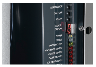
Internal LED indicator lights alert maintenance staff when it's time to descale, sanitize and more