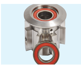
Our proprietary greaseless bearing is fully sealed with a special polymer that provides lubrication without the need for greasing