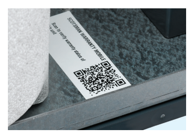
Every model features a convenient QR code for quick access to manuals, parts lists and warranty history information