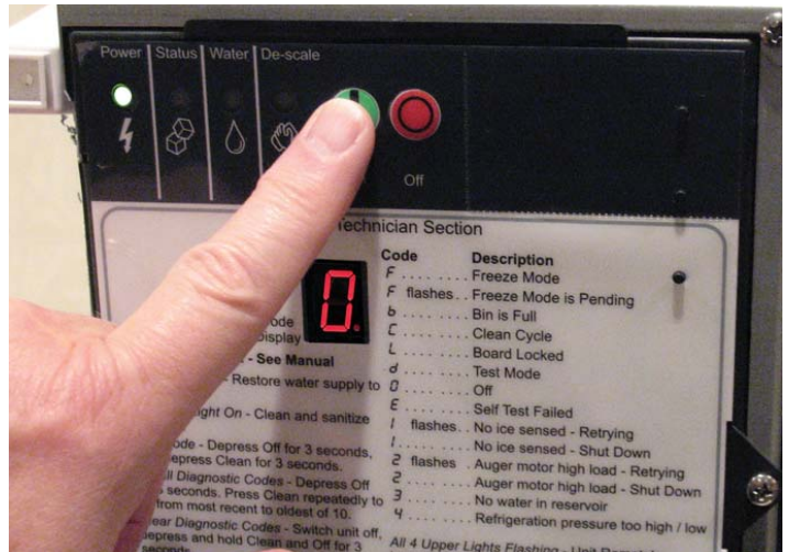
17. Push On to restart ice machine.