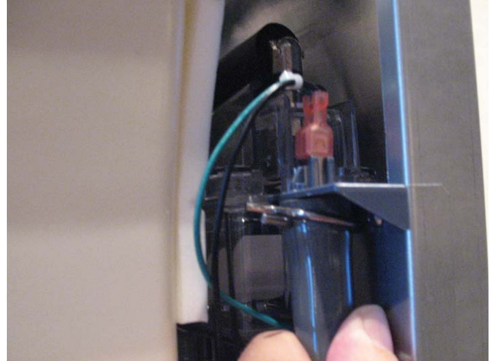
4. Locate drain hose, lower to drain water.