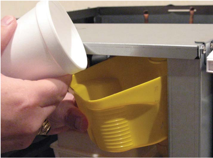
13. After the compressor starts, pour in more solution until it is all used up.

Basic Procedures - see user manual for complete directions.