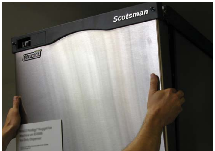
18. Re-attach front panel.