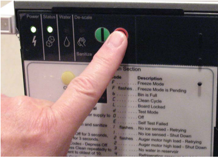
2. Push Off to stop ice making. Discard or catch ice.