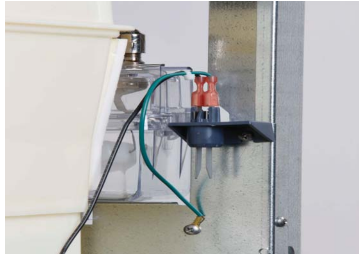
5. Check water sensor.