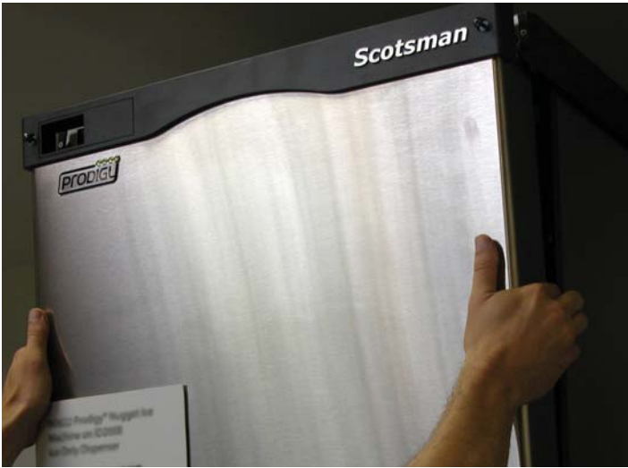
1. Remove front panel

Basic Procedures - see user manual for complete directions.