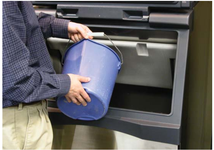
16. Discard or melt any ice made during cleaning.