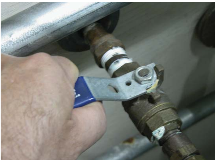
3. Shut off water supply to reservoir.