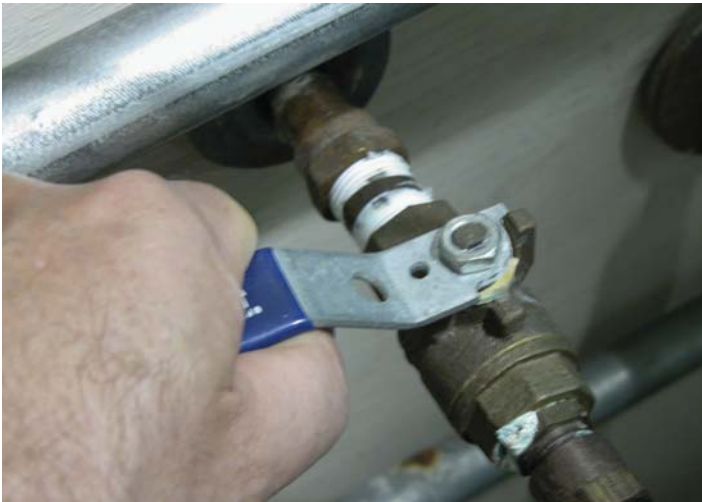
14. Open water valve and remove funnel.