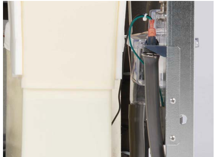
6. Return hose to its original position.