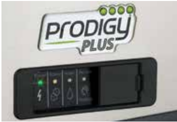
AutoAlert™ indicator lights are easily visible from afar.