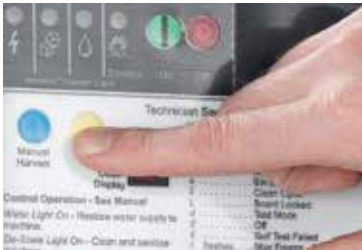
One-touch cleaning helps reduce labor costs.