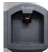
Easy Push Chute