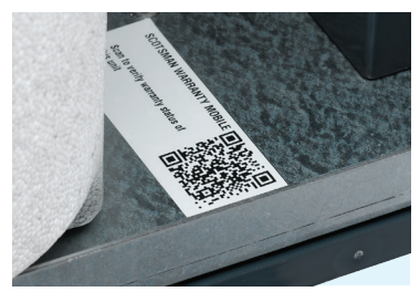
Every model features a convenient QR code for quick access to manuals, parts lists and warranty history information