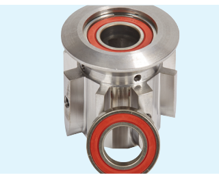
Our proprietary greaseless bearing is fully sealed with a special polymer that provides lubrication without the need for greasing