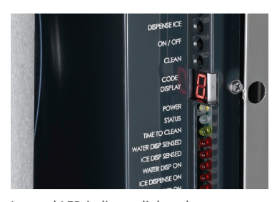
Internal LED indicator lights alert maintenance staff when it's time to descale, sanitize and more