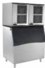
F1222 side by side on B948S