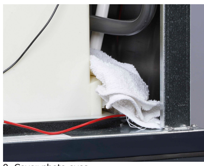
9. Cover photo eyes.