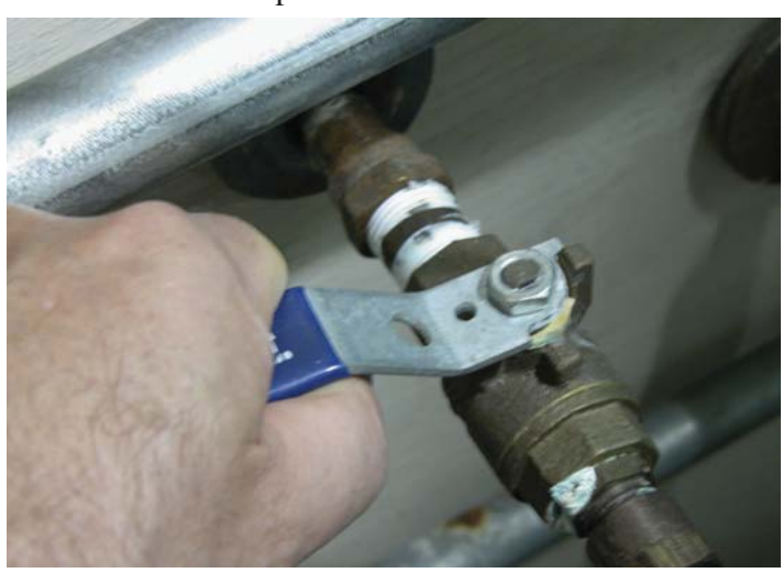
14. Open water valve and remove funnel.