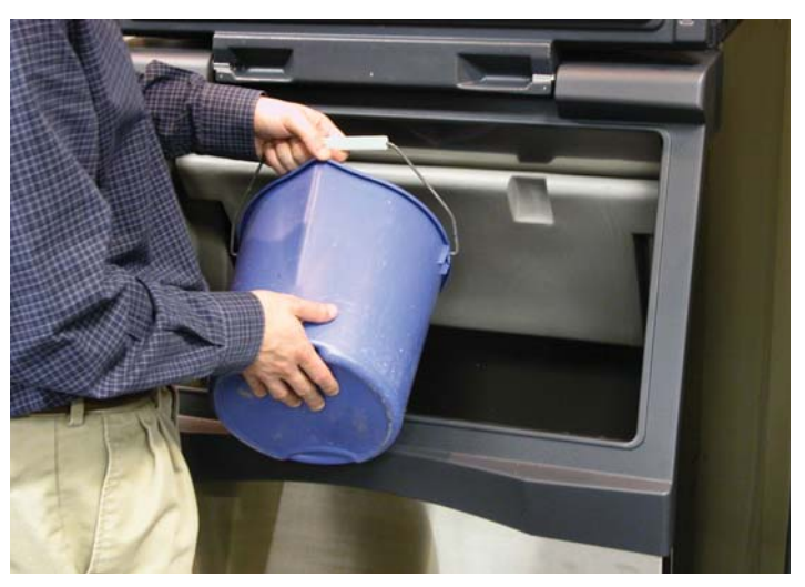
16. Discard or melt any ice made during cleaning.