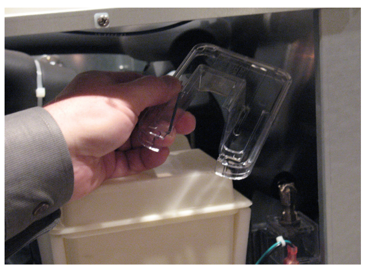
8. Remove reservoir cover.