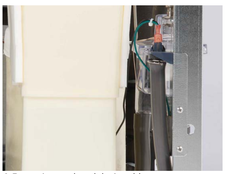
6. Return hose to its original position.