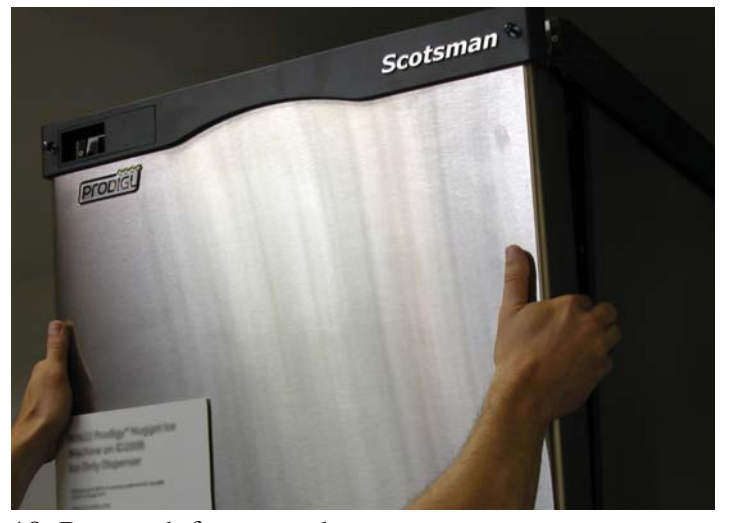
18. Re-attach front panel.