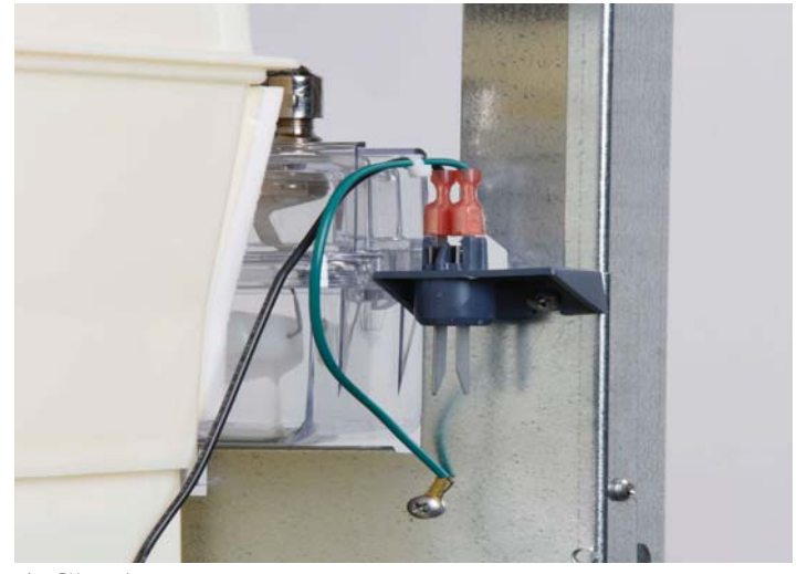
5. Check water sensor.