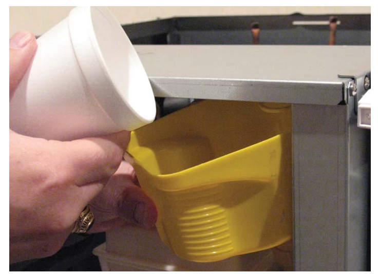
13. After the compressor starts, pour in more solution until it is all used up.

Basic Procedures - see user manual for complete directions.