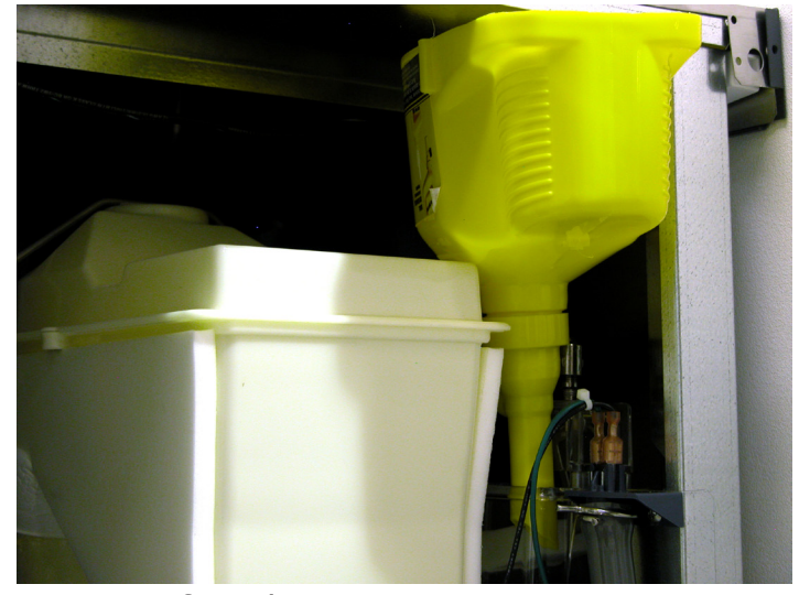
10. Insert funnel in reservoir,

Mix ratio: 3 quarts of warm water to 8 ounces of Scotsman Scale Remover.