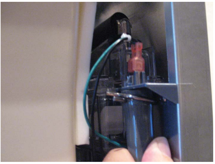
4. Locate drain hose, lower to drain water.