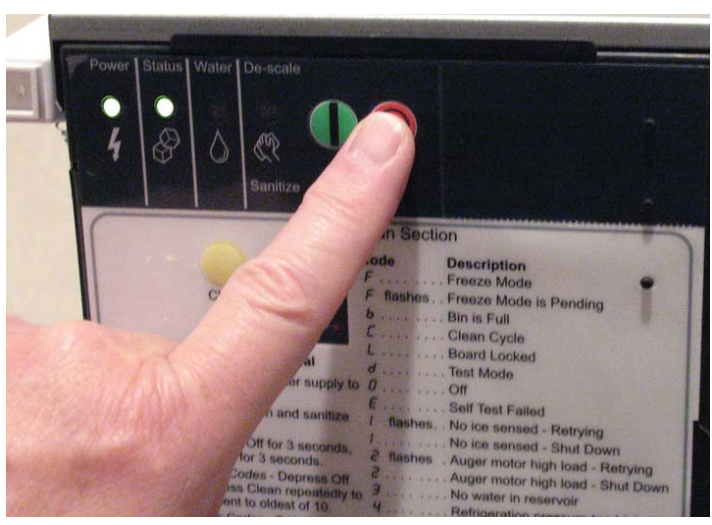
2. Push Off to stop ice making. Discard or catch ice.