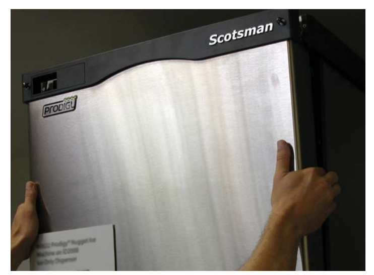
1. Remove front panel

Basic Procedures - see user manual for complete directions.