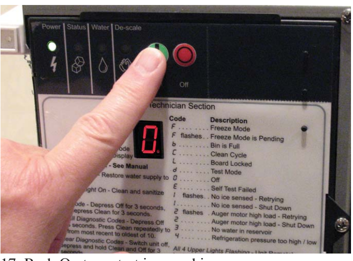
17. Push On to restart ice machine.