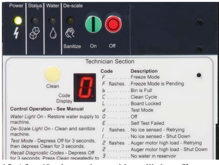
15. After 40 minutes the machine will shut off.