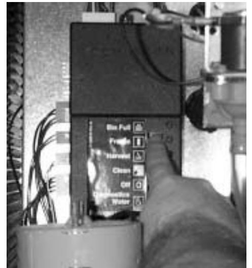
Step 21: Push and Release the Freeze Button

Use the balance of the sanitizing solution to sanitize the interior of the ice storage bin.