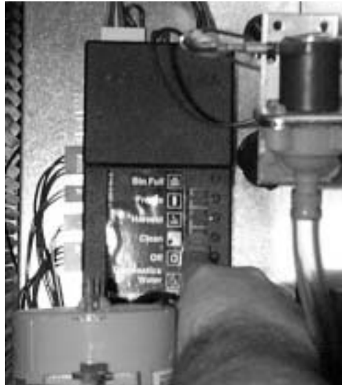
Step 9: Push and Release the Clean Button

Note: Some sanitizers must be rinsed off and some must air dry.