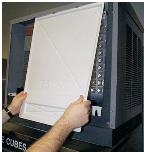
Step 5: Remove Evaporator Cover

6. Push and release the Clean button. The Clean indicator light will be blinking, and the pump will restart.