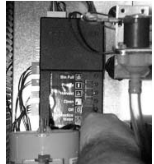
Step 14: Push and Release the Clean Button

22. Return the front panel to its normal position and secure it to the machine with the original screws.