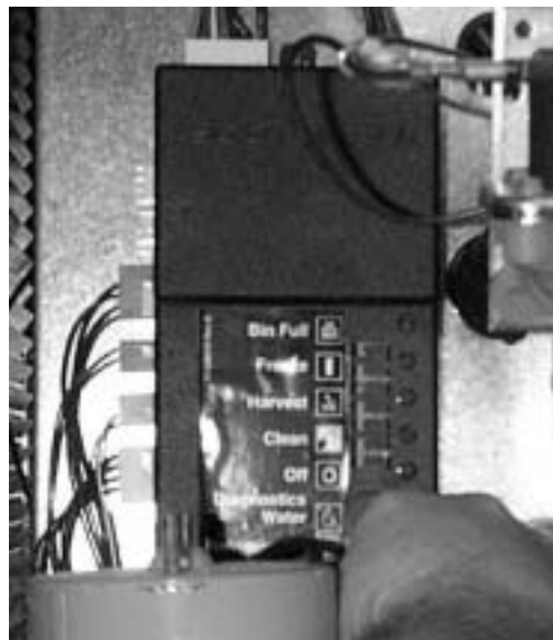
Step 11: Push and Release the Off Button