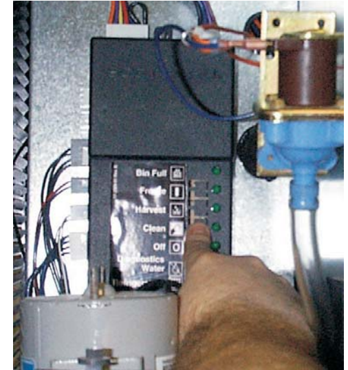
Step 6: Push and Release the Clean Button

6. Push and release the Clean button. The Clean indicator light will be blinking, and the pump will restart.