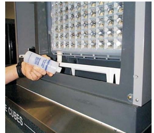
Step 7: Pour Ice Machine Cleaner Into the Reservoir

7. Pour 12 ounces of Scotsman Ice Machine Cleaner into the reservoir water. Return the evaporator cover to its normal position.