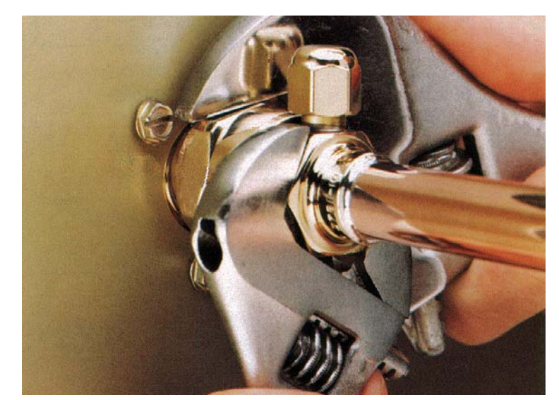
Tighten Swivel Nuts