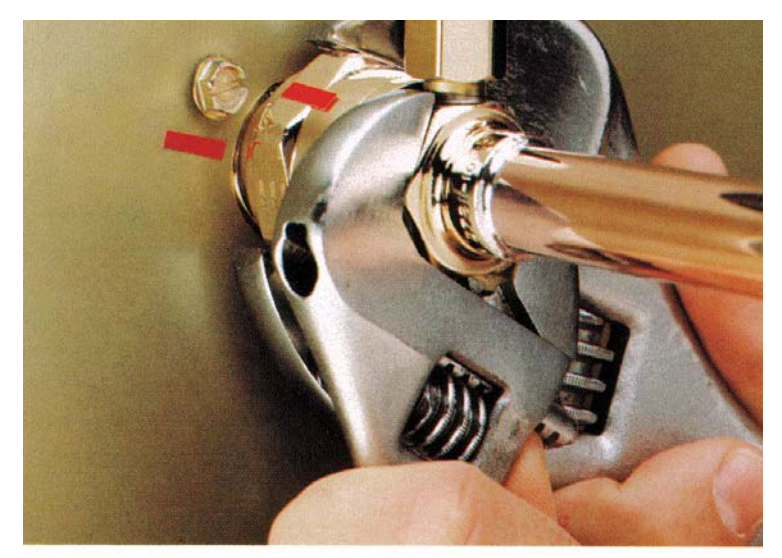
Rotate Each Swivel Nut 1/4 Turn More