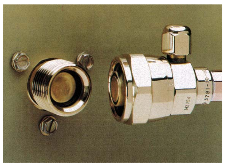
Clean and Lubricate Couplings

13. Finish the balance of the installation. Ice machine's precharged line sets will now connect to the quick connect fittings on the metal box instead of the condenser's.