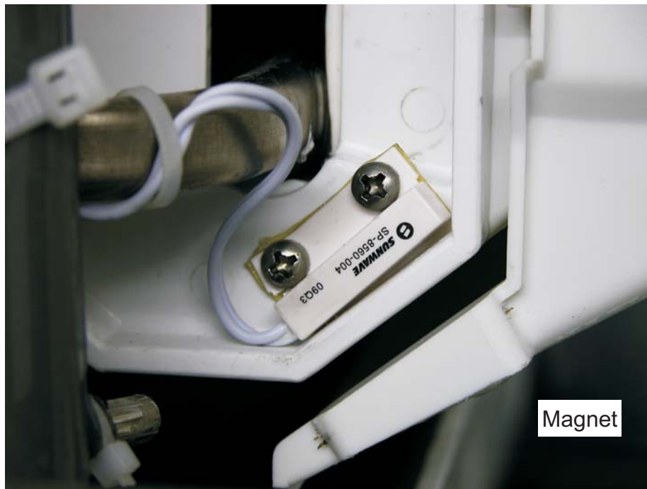
Curtain Switch in New Location