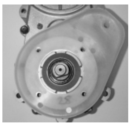
4. Secure the evaporator to the gear box with the original bolts.