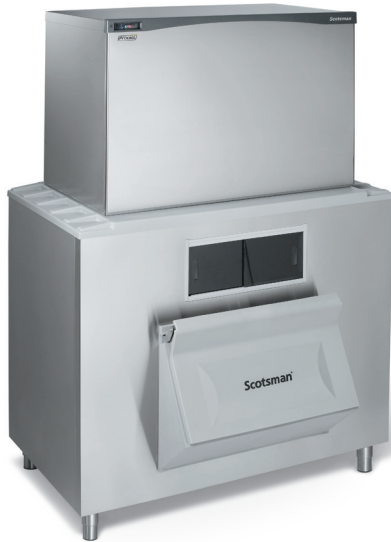
Shown on BH1300BB bin with optional KLP85 legs.