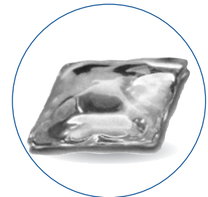
APPROX. CUBE SIZE: 1 3/8" X 1 3/8" X 5/8" THICK