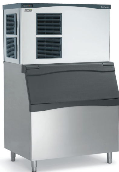
Shown on B485 bin with optional KLP85 legs.