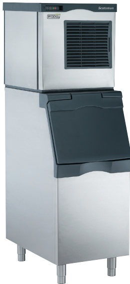
Shown on B322S bin with optional KLP8S legs.