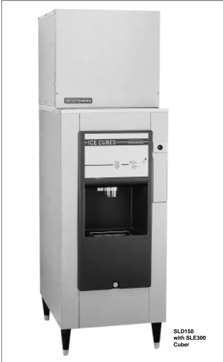
SLD150 with SLE300 Cuber

This product qualifies for the following listings: